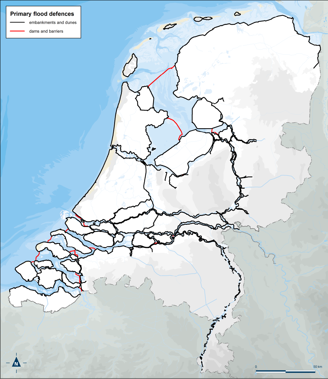
Figure 1 Layout of the Dutch flood protection system

The growth in population and assets to be protected since the 1950/60's call for a revision of the current flood protection standards. There are also new insights in the consequences of flooding to be taken into account. The current standards in The Netherlands are being revised within the framework of the Dutch Delta Programme (Van Alphen et al, 2014). This process did start In 2006/2007 with the policy project 'Flood Protection 21 st Century' (WV21-studies) and will result in a so-called Delta decision on flood risk management in 2014. The development of new standards takes into account climate change and economic development.